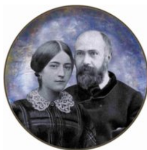
Blessed Zelig and Louis Martin