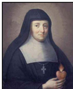
St. Jane de Chantal